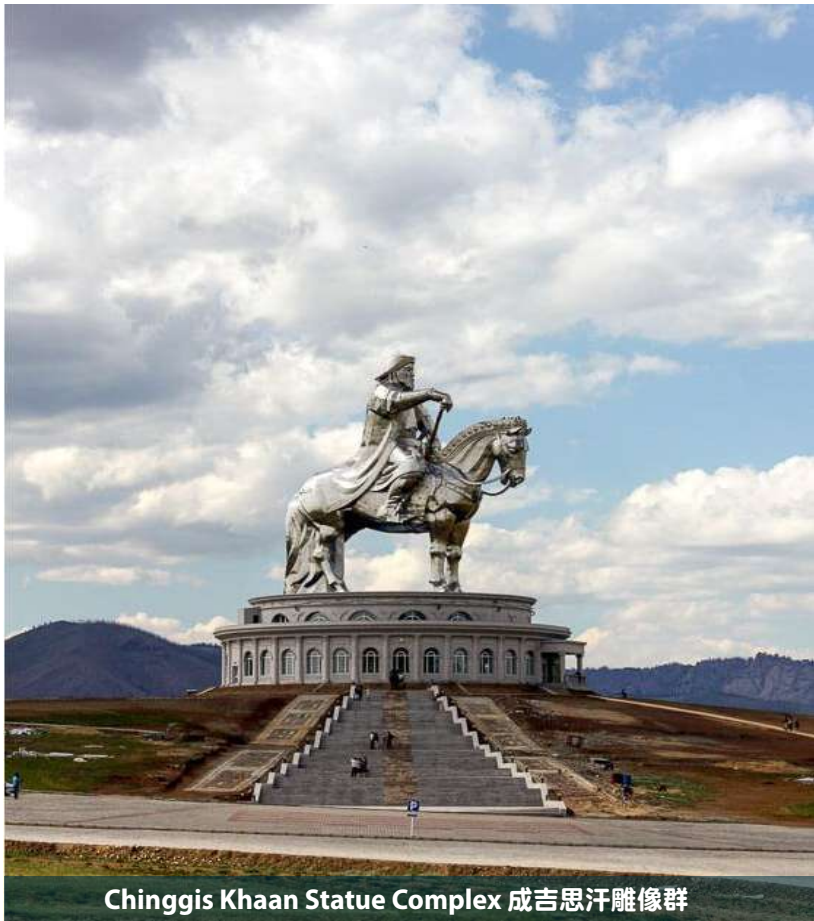
Chinggis Khan Statue Complex 成吉思汗雕像群