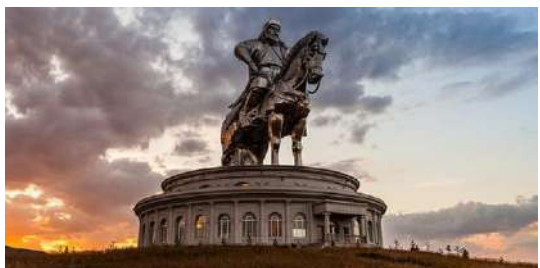
成吉思汗雕像群 Chinggis Khaan Statue Complex