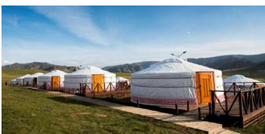
住在蒙古帐篷营地 Stay at Ger Camp