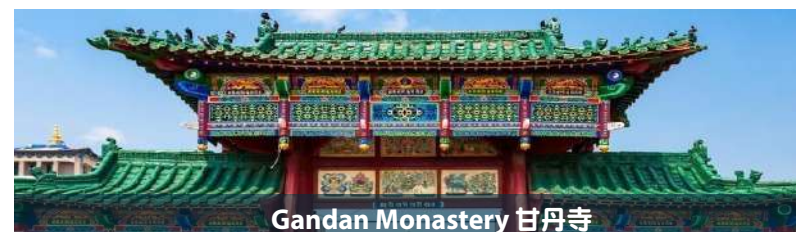
Gandan Monastery 甘丹寺