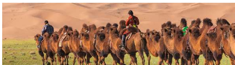
骑骆驼体验 Camel Riding Experience