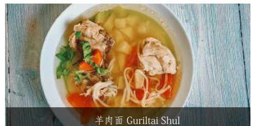
羊肉面 Guriltai Shul