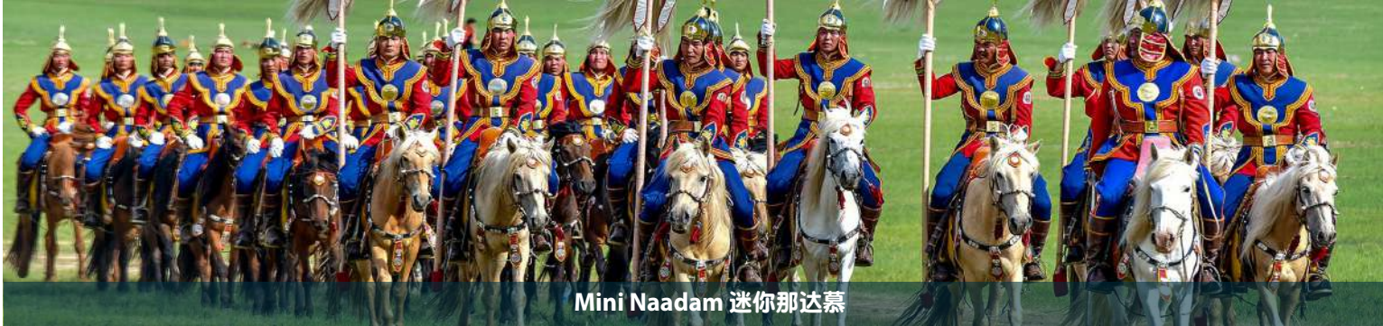
Mini Naadam 迷你那达慕