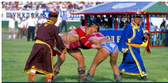
迷你那达慕 Mini Naadam