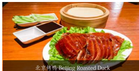
北京烤鸭 Beijing Roasted Duck