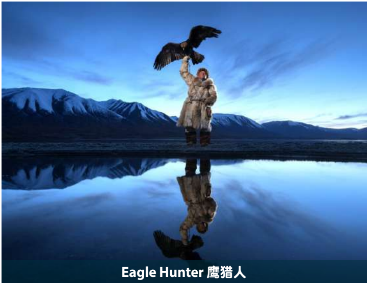
Eagle Hunter 鹰猎人