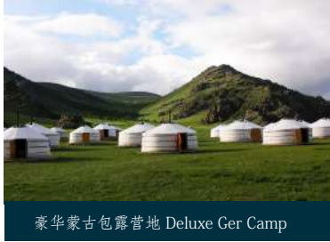
豪华蒙古包露营地 Deluxe Ger Camp