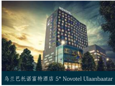
乌兰巴托诺富特酒店 5* Novotel Ulaanbaatar