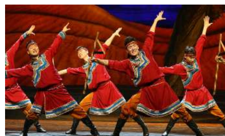
传统民间音乐会 Traditional Folk Concert