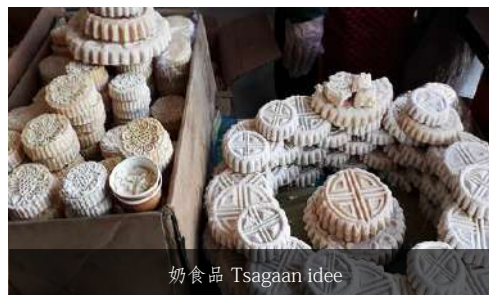
奶食品 Tsagaan idee