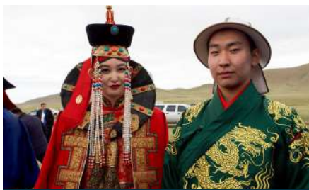
蒙古传统服饰体验 Mongolia Traditional Costume Experience