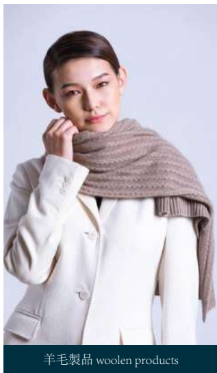
羊毛製品 woolen products