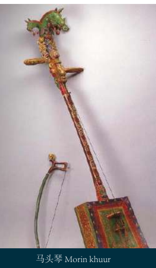
马头琴 Morin khuur