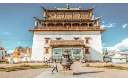
甘丹寺 Ganden Monastery