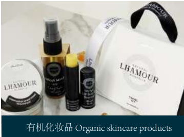
有机化妆品 Organic skincare products