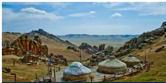
13世纪建筑群 13th century complex