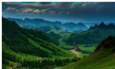
Tereelj 国家公园 Tereelj National park