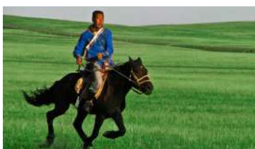
骑马体验 Hourse Riding Experience