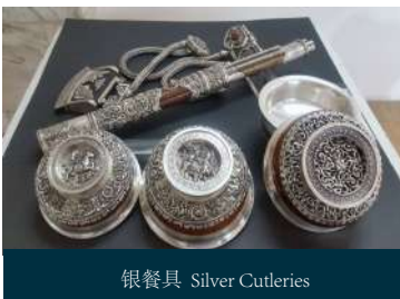
银餐具 Silver Cutleries