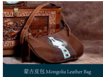
蒙古皮包 Mongolia Leather Bag