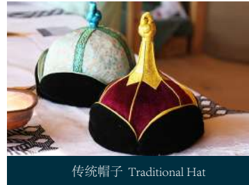
传统帽子 Traditional Hat