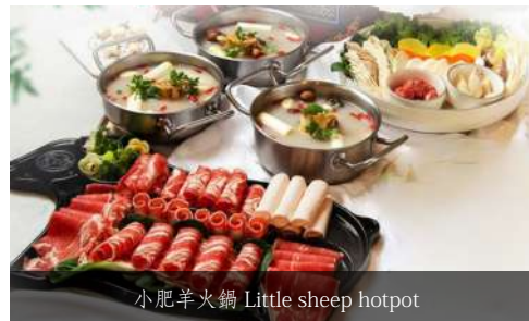
小肥羊火锅 Little sheep hotpot